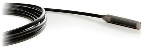
Surgical Small Parts Probe