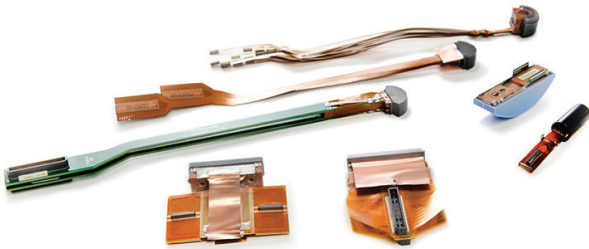
Transducer Array Modules