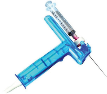
AxoTrack with Vertical Needle Technology